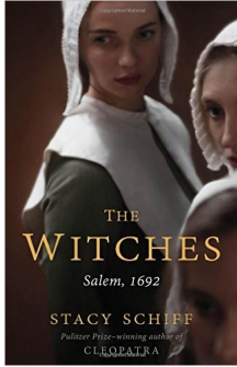
Tuesday, April 26th The Witches by Stacy Schiff